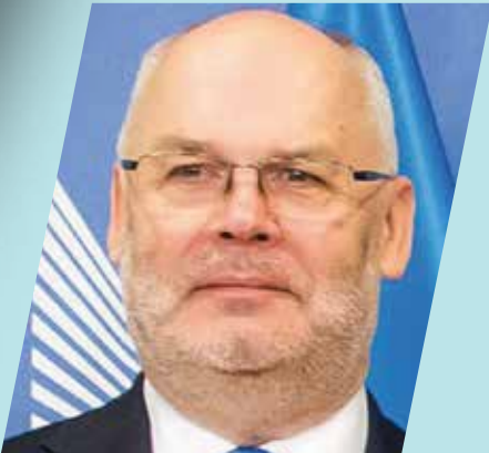
Alar Karis President of Estonia