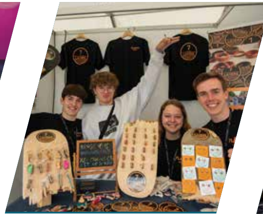
7Layers Belgium FL