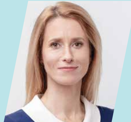
Kaja Kallas Prime Minister of Estonia