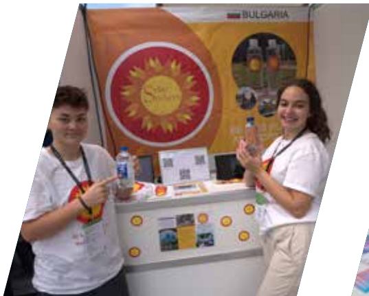
Solar Stickers Bulgaria