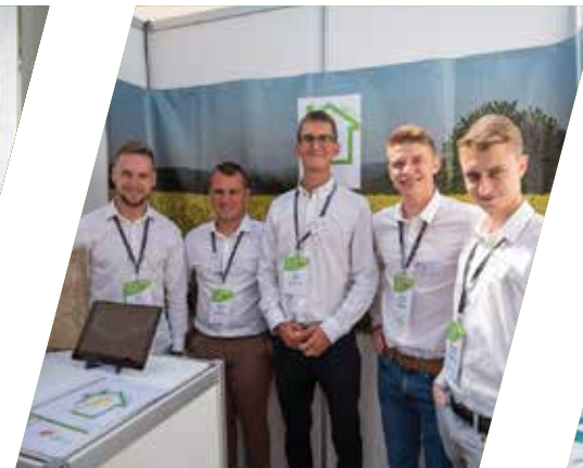
Colz'Iso Belgium FR