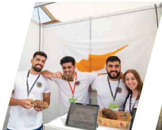
Kolokasi Delicacies Cyprus