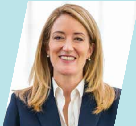
Roberta Metsola President of the European Parliament