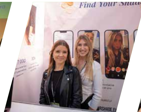
Find Your Shade Estonia