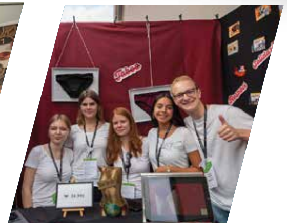
Don't Be Shy Belgium FR