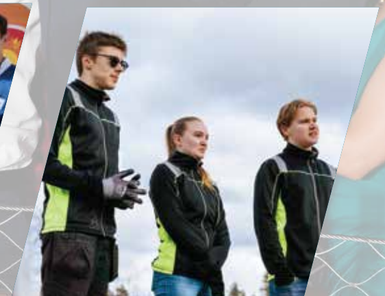
Noll Deponi Sweden