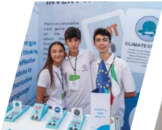
Eion Games Italy