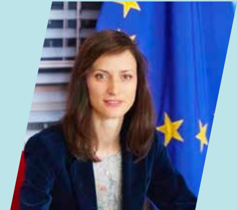
Mariya Gabriel EU Commissioner for Innovation, Research, Culture, Education and Youth